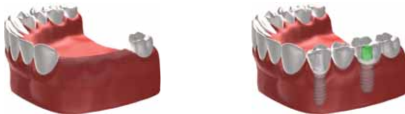
Replacement of several teeth.