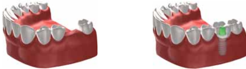
Replacement of one tooth.