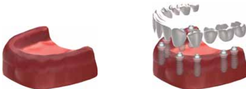
Replacement of all teeth with a non-removable bridge.