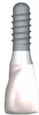
Dental implant with crown