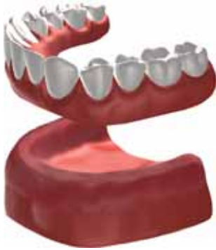
Traditional removable full denture

Conventional removable full dentures attach to the jaw with a type of suction effect. Because there is no stimulation of the bone, it may deteriorate over time. As the bone recedes, the dentures may no longer fit properly. Ill-fitting dentures can be painful and cause problems with eating, speaking, and esthetics.