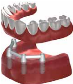
Examples of implant – supported overdentures

With implant-supported dentures, the inconveniences of ill-fitting conventional dentures and the need for adhesives are eliminated. The implant provides a stable foundation for the removable denture while helping preserve the jawbone. The denture is attached to an anchorage and can be easily removed for cleaning and then snapped back firmly into place.